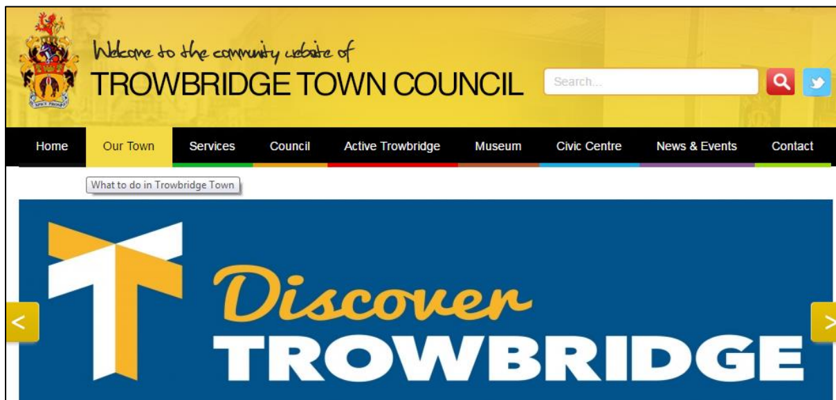
Figure 4: Trowbridge Town Council Home Page

The Town Council would add a tennis specific page to the existing town council website (see below)