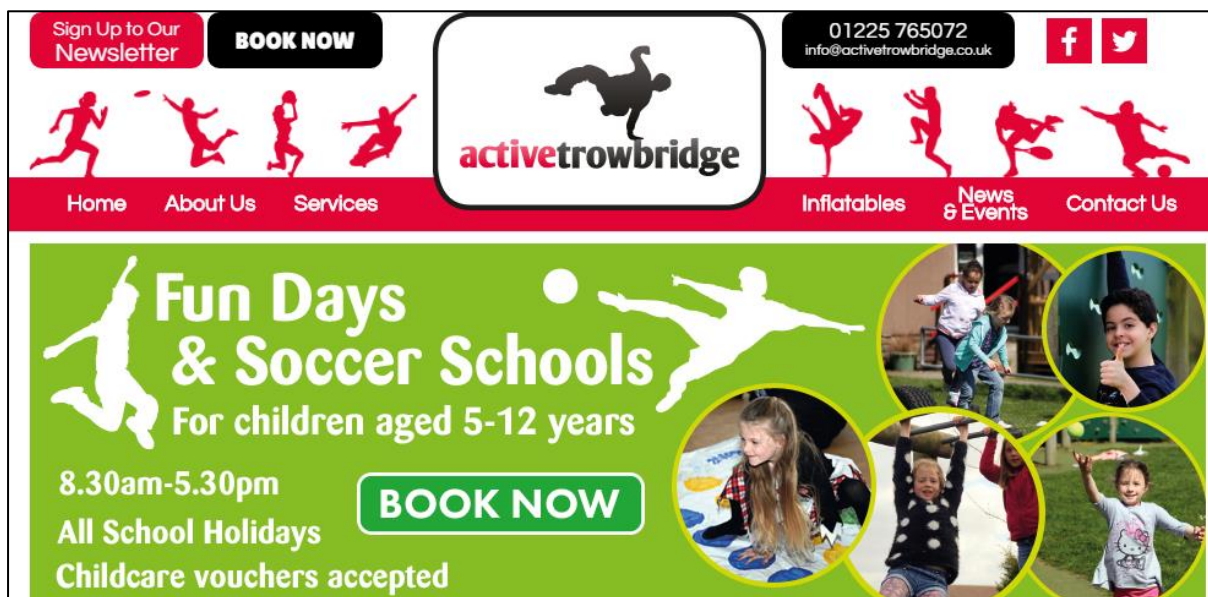
Figure 5: Screenshot of Active Trowbridge Home Page

Trowbridge Town Council has a delivery arm called Active Trowbridge. Active Trowbridge was started in 2008 to provide exciting, innovative and affordable sporting opportunities for the community. Now, in 2015, we have 16 qualified Sports Coaches and the service they provide to the community has become integral. We are excited to lead the way with key partners in developing sport and healthy lifestyles and shape the future of sport for all.